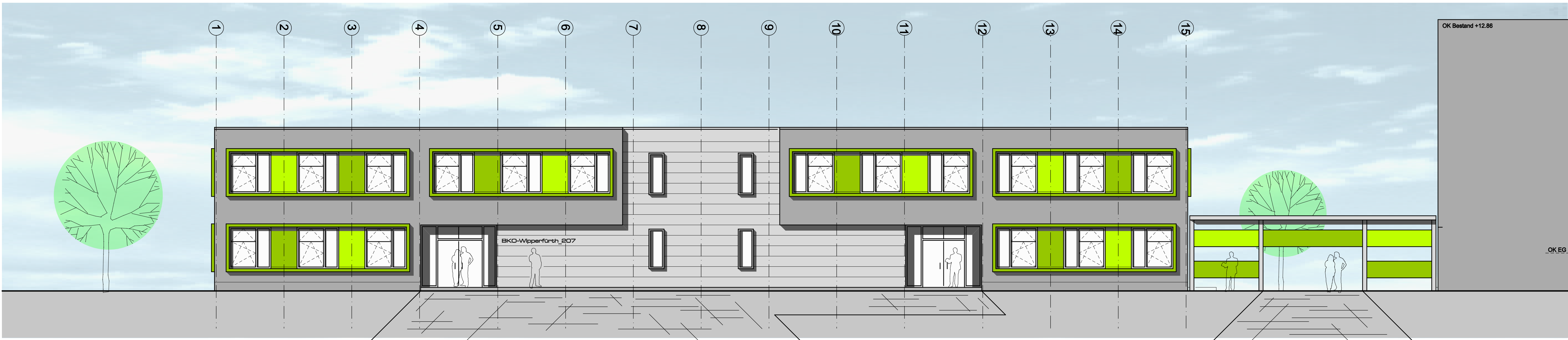
Ansicht Osten 1:100